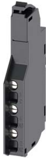
AUXILIARY SWITCH CHANGEOVER CONTACTS TYPE HQ (7MM) ACCESSORY FOR 3VA-BREAKER