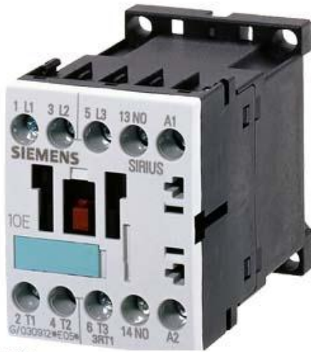
CONTACTOR, AC-3 3 KW/400 V, 1 NC, DC 24 V, 3-POLE, SIZE S00, SCREW CONNECTION