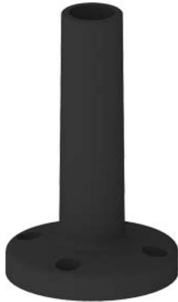
SIGNAL COLUMNS, DIAMETER 70MM ACCESSORIES BASE WITH TUBE (100MM)