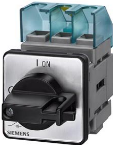
MAIN CONTROL SWITCH 3-POLE IU=32, P/AC-23A AT 400V=11,5KW FRONT MOUNTING FOUR- HOLE MOUNTING KNOB BLACK