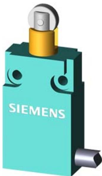
COMPACT SWITCH 30MM WIDE W. CONNECTING CABLE 2M SNAP-ACTION CONTACTS 1NO+1NC ROLLER PLUNGER