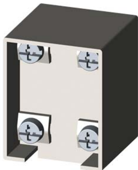
CONTACT BLOCK FOR POSITION SWITCH 3SE51/52 1NO/1NC SNAP-ACTION CONTACT