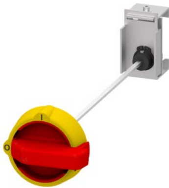
Rotary operating mechanism compl. red for 5SY (without 5SY compact 1 MW) 5SP4, 5SL, 5TL1, 5TE2, 5TE8 5SU1