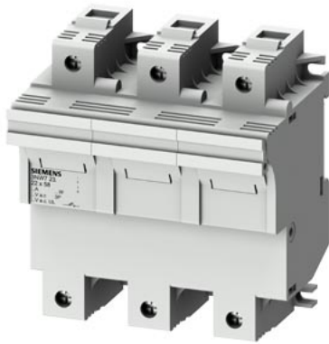
SENTRON, cylindrical fuse holder, 22x58 mm, 3-pole, In: 100 A, Un AC: 690 V